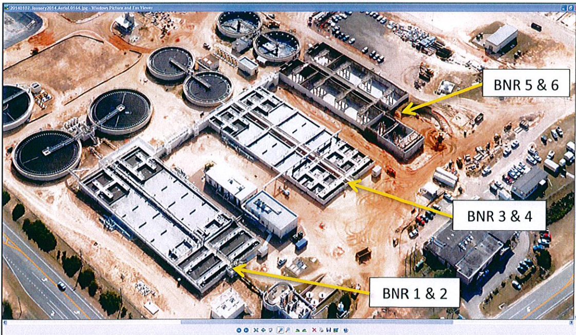
January 7, 2014

Following is a portion of an aerial photograph of the BNR3 & BNR4 area taken on January 7, 2014. The photograph shows that BNR 3 & 4 have been returned to service and that work is underway on BNR 5 & 6.